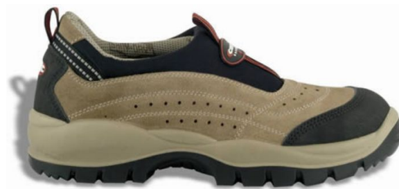
Figure 2: A possible type of safety shoe to be used at the MAGIC site. Hiking shoes are also accepted.

At the MAGIC site you should always wear proper boots , i. e. safety boots or hiking boots. You must always wear proper boots when you enter the restricted areas or the fences surrounding the telescopes. A typical safety shoe is shown in Figure 2.