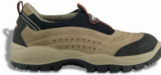
Figure 2: A possible type of safety shoe to be used at the MAGIC site. Hiking shoes are also accepted.